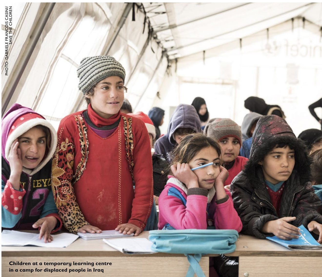
Children at a temporary learning centre in a camp for displaced people in Iraq

and psychosocial support systems in countries affected by conflict. The CAMH diploma should be accessible to non-English speakers and those in remote locations. Given the number of children affected by protracted conflicts in the Middle East region, we propose that this region is prioritised for developing and piloting such a diploma and we are engaging with academic partners to do so. As the development of the diploma progresses, donors should pledge financial support for the development and roll-out of an MHPSS diploma, with enrolment commencing in 2021.