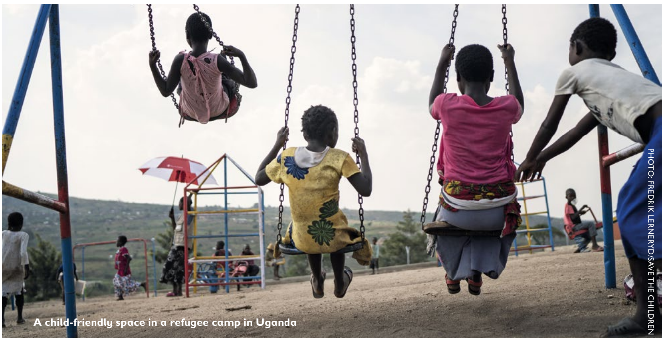
A child-friendly space in a refugee camp in Uganda

However, it is insufficient to respond only to children’s mental health. States must protect it. This will only be achieved if states and the wider international community tackle the impunity of those who perpetrate grave violations against children, uphold the norms and standards of conflict, and do much more to protect children in conflict on the ground. As set out in the Stop the War on Children report, 34 states can take action in a number of ways. Governments should use the opportunity of the UN General Assembly in 2019 to set out how they are fulfilling their obligations to children, and how they will make progress against the following measures.