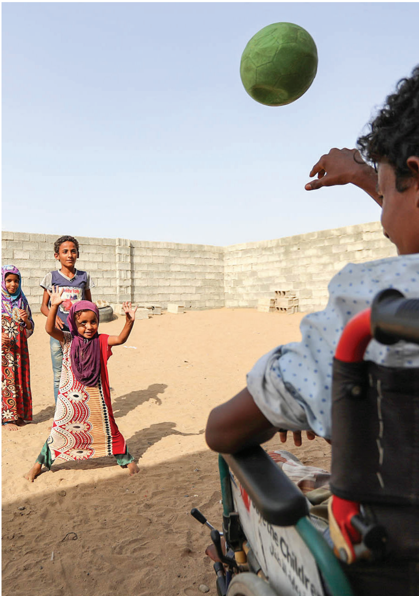
Children playing with a ball in their backyard. Photo taken on February 04, 2020.