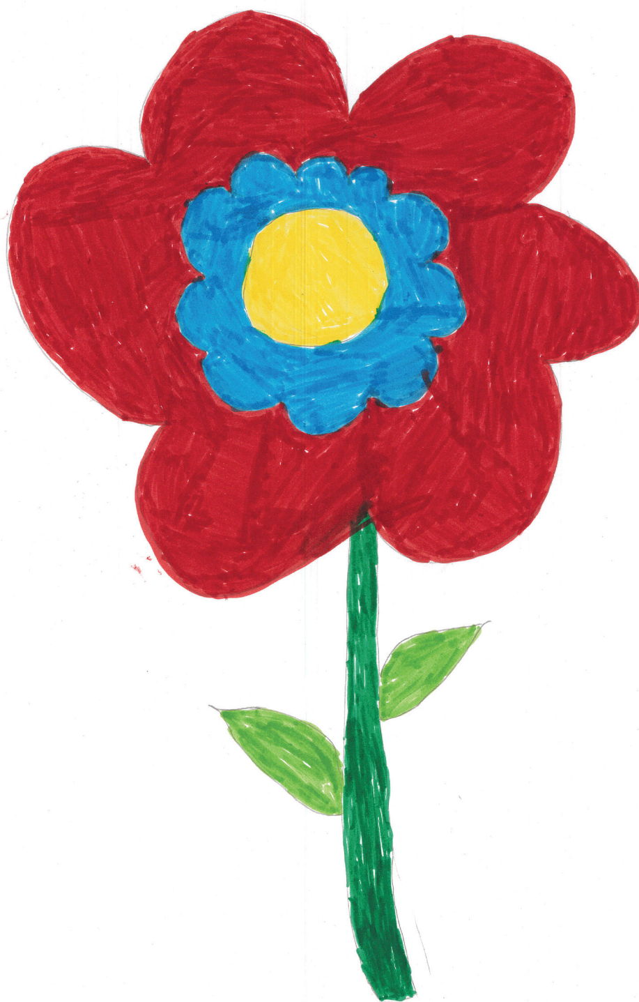
A drawing of a flower done by a 13-year-old girl from the city of Taiz as part of a drawing workshop conducted by Save the Children's child protection team in March 2022.