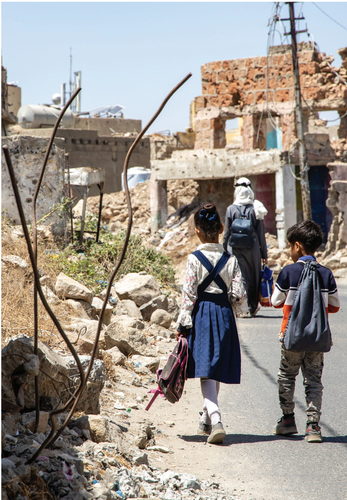
Two school kids walking back home by the ruins of buildings destroyed in bombardment in the city of Taiz, March 2022.