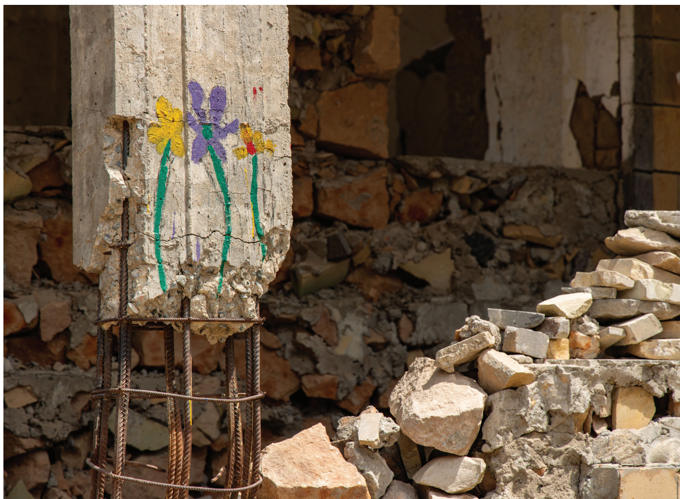
Flower mural on the ruins of school destroyed by an airstrike in the city of Taiz southwestern Yemen, March 2022.