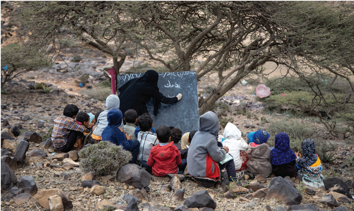
A group of student and their teacher having their class under a tree following the destruction of their school in an aerial attack in southwestern Yemen. January 26, 2021.

However, in some cases, the damage to schools is so severe that there are no safe zones where teachers and students can take shelter if the school comes under attack. “There aren’t any safety measures for contingencies, the school is already severely damaged because it has been repeatedly hit... There are no safe zones or spaces inside the school, when the school comes under attack classes are suspended and children are evacuated promptly. If the fighting is very intense, both teachers and children remained in the school until the situation calms,” said a deputy school principal from Al Dhale. Both education workers interviewed in Al Dhale reported that 60 – 80 per cent of schools in their communities have been harmed or damaged by the conflict, as well as their own schools sustaining critical and catastrophic damage.