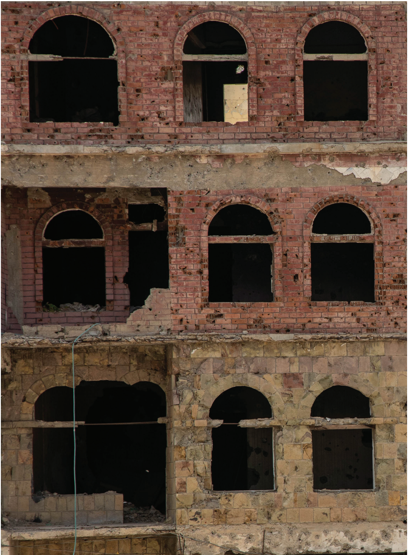
The front side of a building that sustained damage during ground fighting and bombardment in the city of Taiz, March 2022.