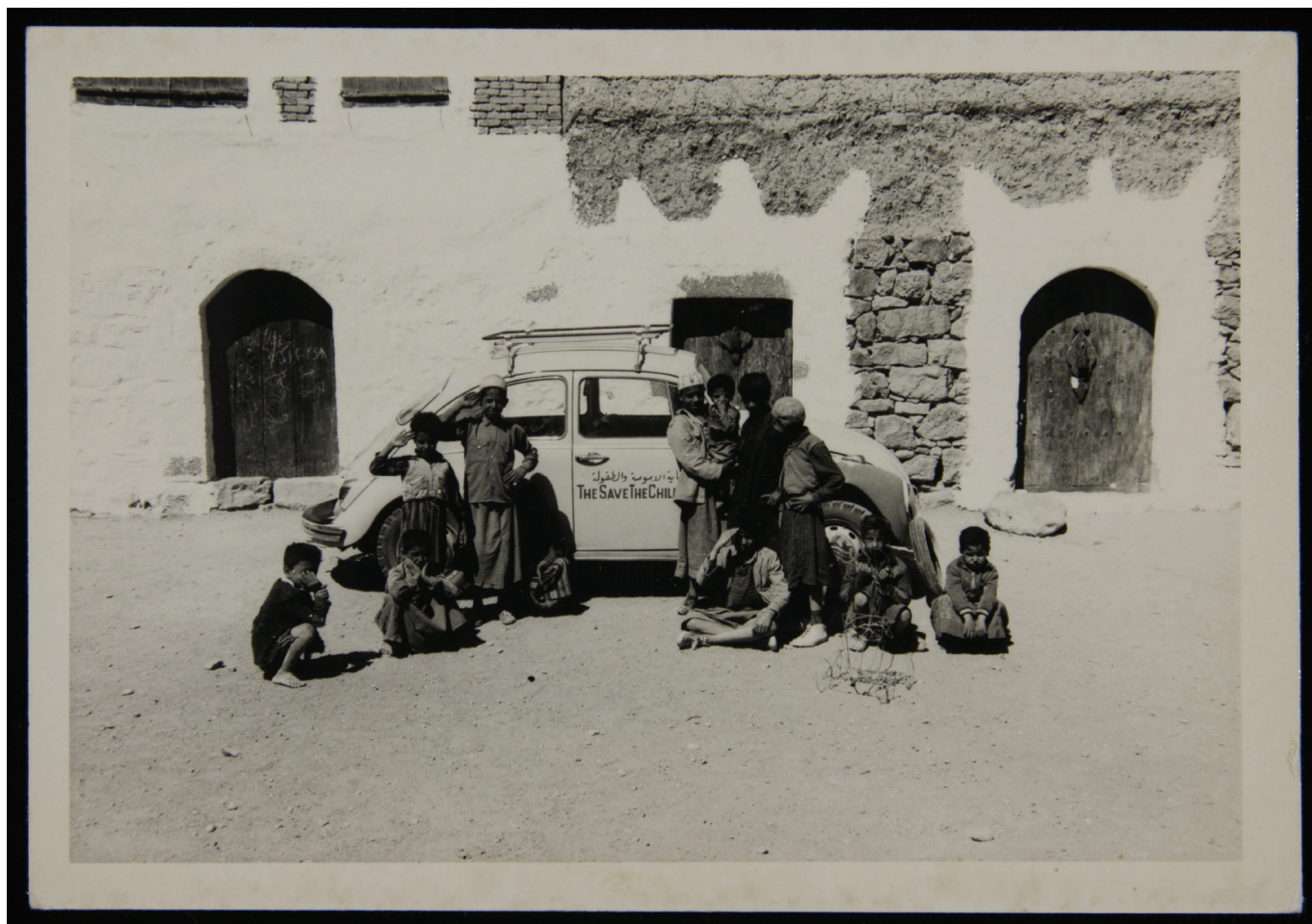
Children outside the Save the Children clinic in al-Rawdah, Yemen. c. 1972. The end of eight years of civil war gave the Fund an opportunity to establish long term development programmes. A survey carried out in June 1972 was followed by the opening of five mother and child welfare clinics, with the Fund's centre of operations at al-Rawdah. Through these clinics much assistance was given to disabled children and those suffering from polio. An immunisation programme was also introduced with work initially being concentrated on Sana'a and the surrounding area. Exact date unknown.

Since 2015, there were at least 76 airstrikes reported against healthcare facilities, including hospitals, clinics and health centres across Yemen. 4 The highest number of airstrikes against healthcare facilities was reported in Sa'ada, followed by Hajja and Taiz, and nearly half of the healthcare providers interviewed reported being present at the healthcare facility during an attack, and ninety-three per cent of health workers surveyed said that services at health facilities where they work have been repeatedly suspended due to attacks.