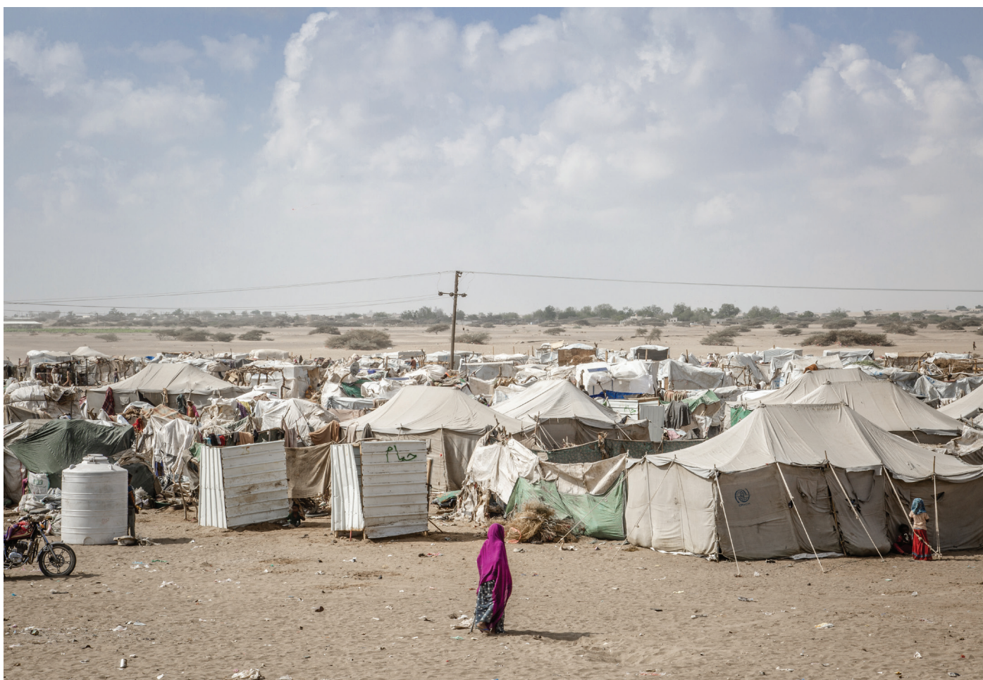
A wide shot of a camp for Internally Displaced People (IDP), Lahj, Yemen. Photo taken on November 08, 2018.

Another female nurse in Aden described a time when clashes suddenly broke out next to the hospital during her shift; “a clash between two groups occurred suddenly near the facility. It was terrifying, everyone in the health complex that day panicked, including staff and patients, everyone remained in the facility, cornered away far from windows and open areas, such as the main entrance. We stayed like this for hours, until we could no longer hear shooting outside. Even then, we feared going out, people began to move outside of the facility very cautiously, fearing clashes could erupt again.”