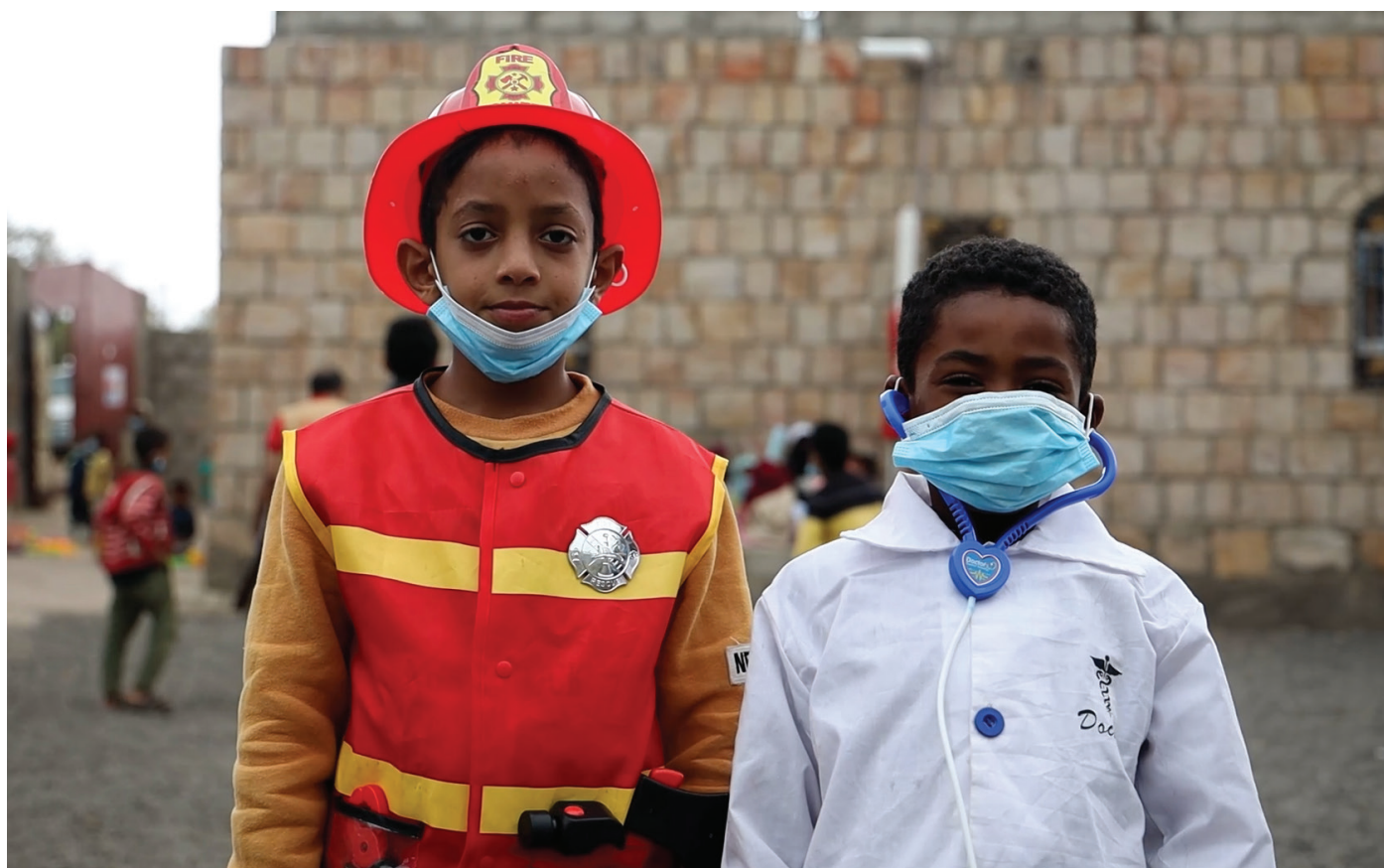
Social Centres are an important place for learning and play for children in Yemen. They give children a special place to be with their friends, or just have a break from everyday life. At this social centre in Taiz, children and young adults play organised games, learn crafts or try new skills such as hairdressing or sewing. The dedicated staff and volunteers ensure the environment is COVID-19 safe while they have an enjoyable time. Photo taken on August 26, 2021.

The conflict in Yemen has damaged at least 540 health facilities, 84 of which have been destroyed. 28 Attacks against and near healthcare facilities affect their functionality, often rendering them unsafe and inaccessible.