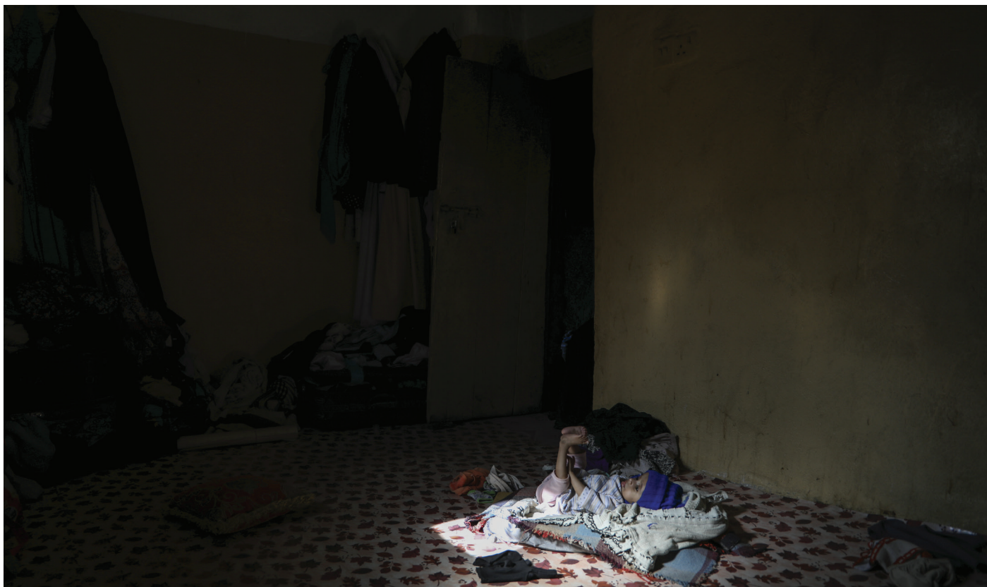
Suha*, 8 months, back at home after receiving treatment for malnutrition, Taiz, Yemen. Photo taken on January 26, 2021.

Additionally, remittances are one of the primary sources of foreign currency, which is critical to financing imports and Yemen's balance of payments. 42 Throughout the past seven years, remittances helped vulnerable households in Yemen (many of which remittances constituted their primary source of income) stay afloat and cope with the various socioeconomic shocks that swept the country, including the sharp depreciation of the local currency, loss of income, inflation, and rising unemployment. 43