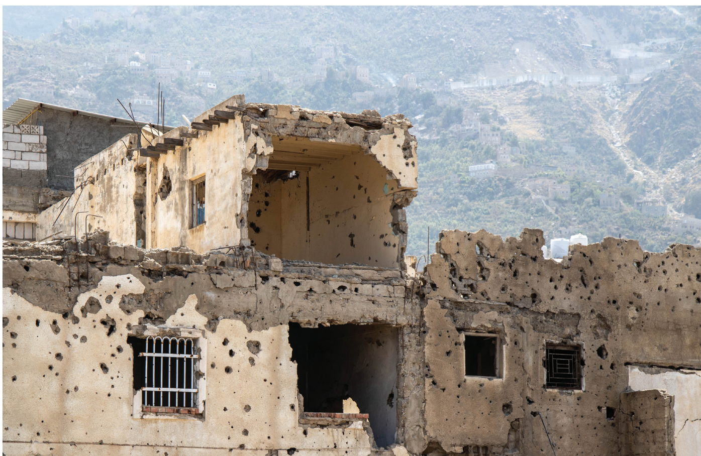
The remains of a building damage by ground fighting and bombardment in the city of Taiz, March 2022.

“Children are growing isolated and introverted; they no longer interact with their communities and peers...some have been born into this and do not know what a friend is” said an aid worker from Taiz. In fact, an aid worker in Al Dhale expressed particular concern about girls’ ability to develop their personalities and awareness in these circumstances, as to begin with, girls have very limited spaces to interact with others outside of their homes. Therefore, not being able to go to school to interact with their peers significantly affects their development, awareness and self-confidence, but most importantly, their ability to cope with stress.