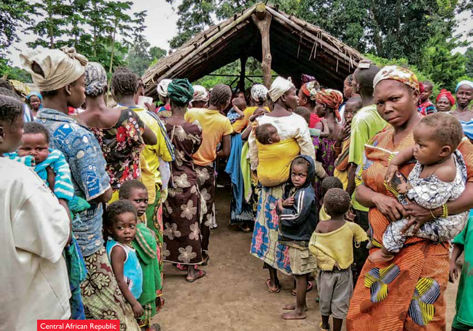
Central African Republic

identify and explore the specific vulnerabilities of different groups, including pregnant and lactating women, and mothers more broadly. These need to be monitored to take into account the changing risk context and ensure activities and interventions are appropriate.