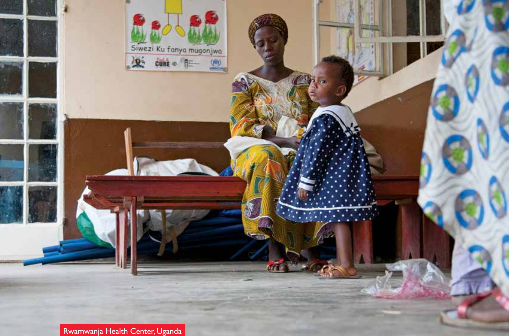
Rwamwanja Health Center, Uganda