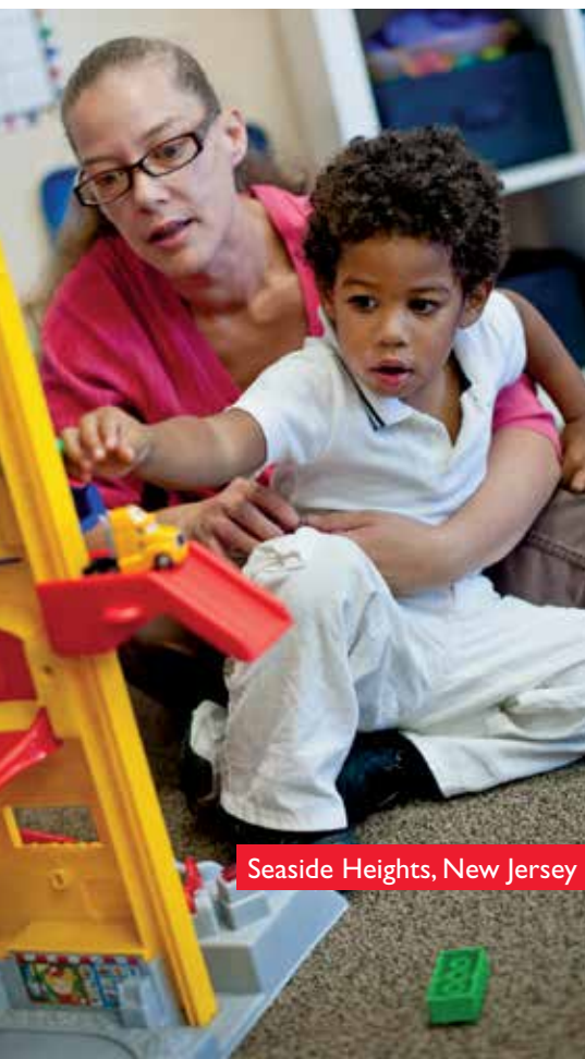
Seaside Heights, New Jersey

For my son, it messed up a lot. He wasn't able to play like he used to. He wasn't able to go to the park. He wasn't able to see the people he saw on a daily basis because we weren't able to go anywhere. We had to walk on the highway even to go to the nearest convenience store. So it stopped him from talking. It stopped him from wanting to feed himself and to play. He just pretty much stayed immobilized. [Now,] being around other children, just having a regular schedule, it's helped him a lot. He's starting to speak a little bit. He tries to explain more of what he wants. He doesn't have the tantrums he had before. He was doing at least 10 tantrums a day.... Having him here in the day care has helped me emotionally, because now I know my son is stable. My anxiety level is not so high anymore. I can breathe again." 12