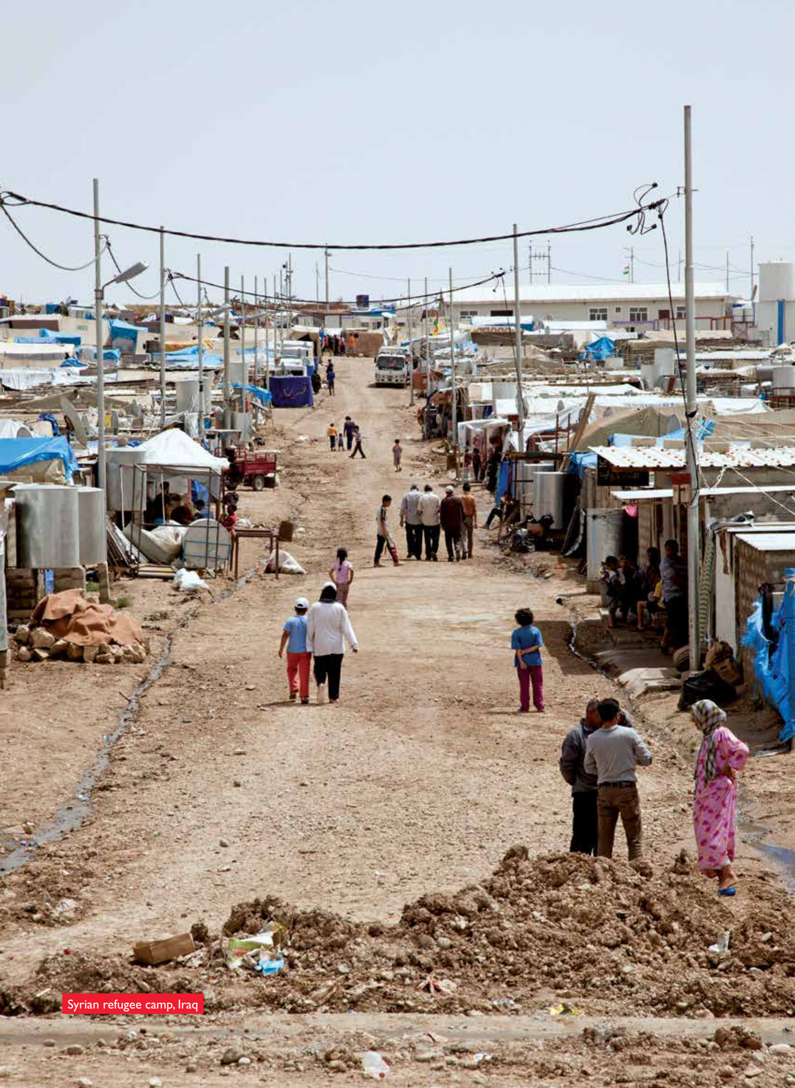
Syrian refugee camp, Iraq