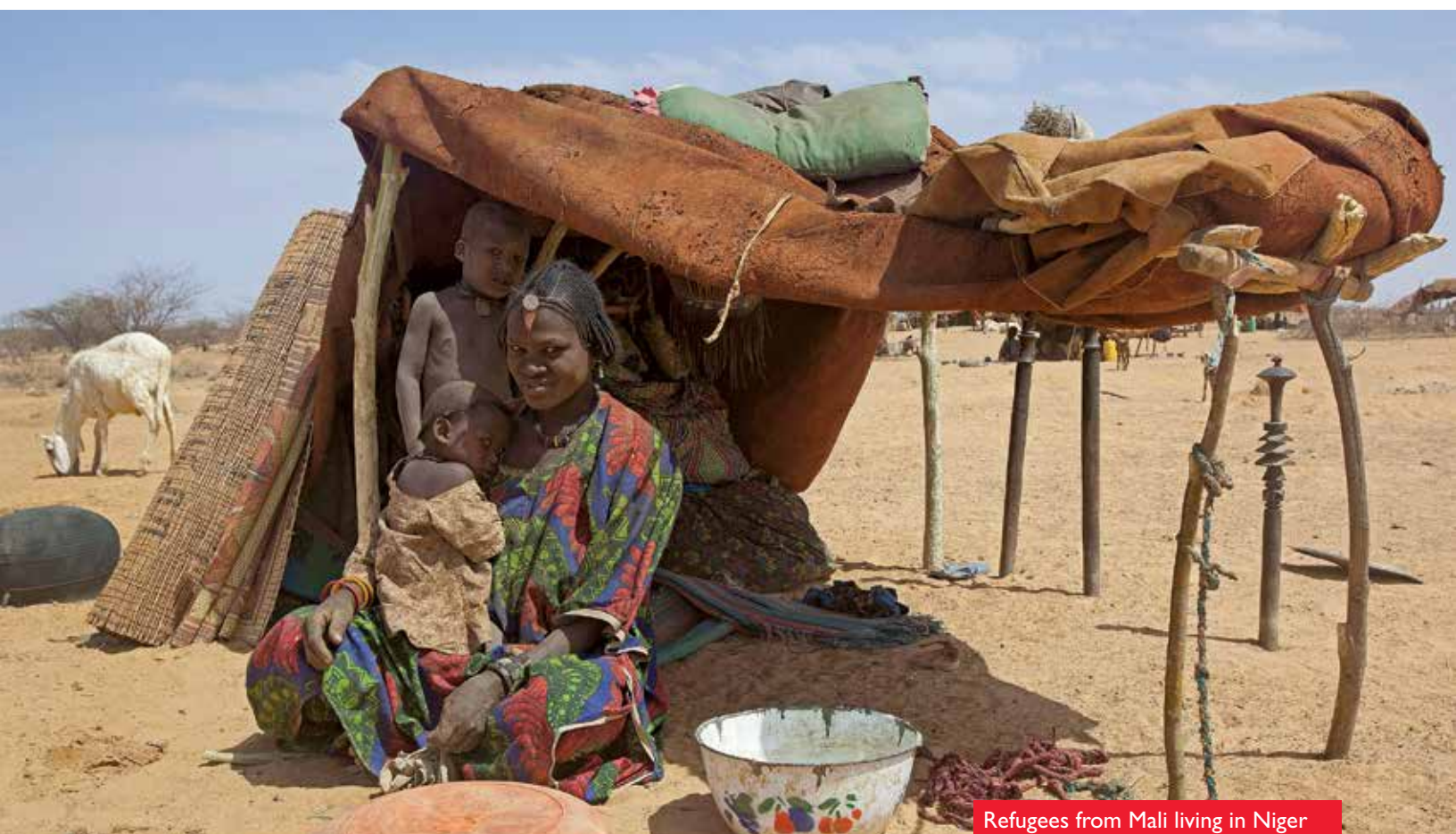
Refugees from Mali living in Niger

The national-level data presented in the Mothers' Index provide an overview of many countries. However, it is important to remember that the condition of geographic or ethnic sub-groups and the poorest families in a country may vary greatly from the national average. Remote rural areas and urban slums often have fewer services and more dire statistics. War, violence, corruption and lawlessness also do great harm to the well-being of mothers and children, and often affect certain segments of the population disproportionately. These details are hidden when only broad national-level data are available.